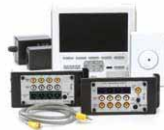
CM5451-WH Camera and LCD Kit