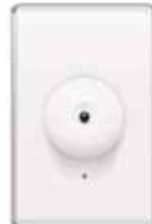
CM5002-XX Ball Camera