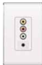
HA5201-XX TV Display Interface