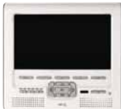
HA5000-XX Studio LCD Console